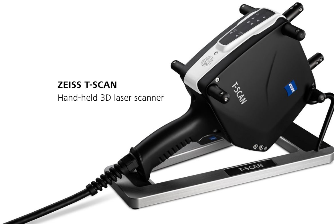
ZEISS T-SCAN Hand-held 3D laser scanner

Combine a hand-held laser scanner and a touch probe with the optical tracking system of your choice: the established ZEISS T-TRACK 20 for large measuring volumes of up to 20 m 3 or the new ZEISS T-TRACK 10 for a smaller measuring volume and higher accuracy.