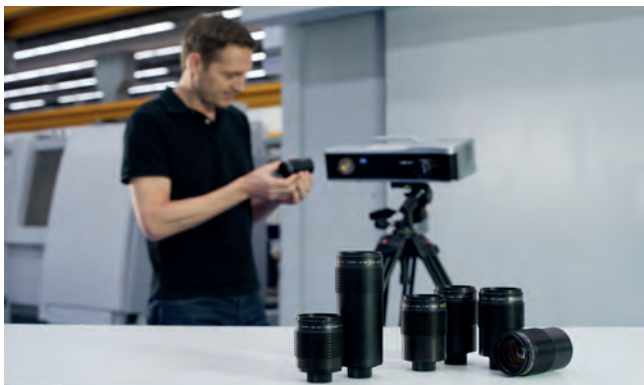
The right sensor for every application: Customize the measuring field (45 - 500 mm) quickly by simply changing the lens

The high-performance software platform colin3D ensures a consistently efficient and project-oriented procedure during the entire measuring process.